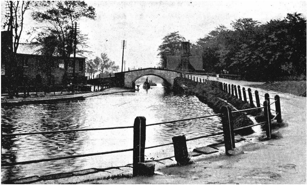
Monton Bridge circa 1885

The photograph, Monton Bridge circa 1885, shows the original bridge over the Bridgewater Canal, the lodge at Dukes Drive can be clearly seen behind the bridge. The building on the left was an off licence and is now the Waterside Restaurant.