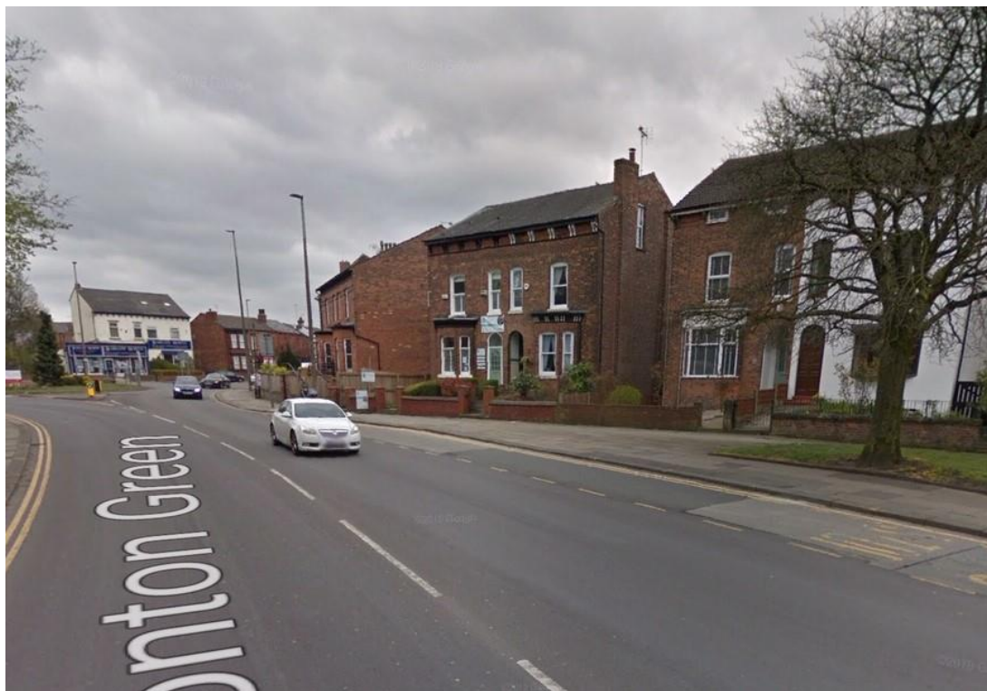
Google Street View - Monton Green - 2020

The photograph, Monton Green c1885 shows a wonderful view looking across to the Blue Bell Inn; the original inn shown in this photograph was rebuilt in 1902. As drones were not that common in Victorian times, this photograph must have been taken from the railway station adjacent to the railway bridge. The houses on the right, one in particular, have changed very little in 140 years as the Google street view photograph shows.