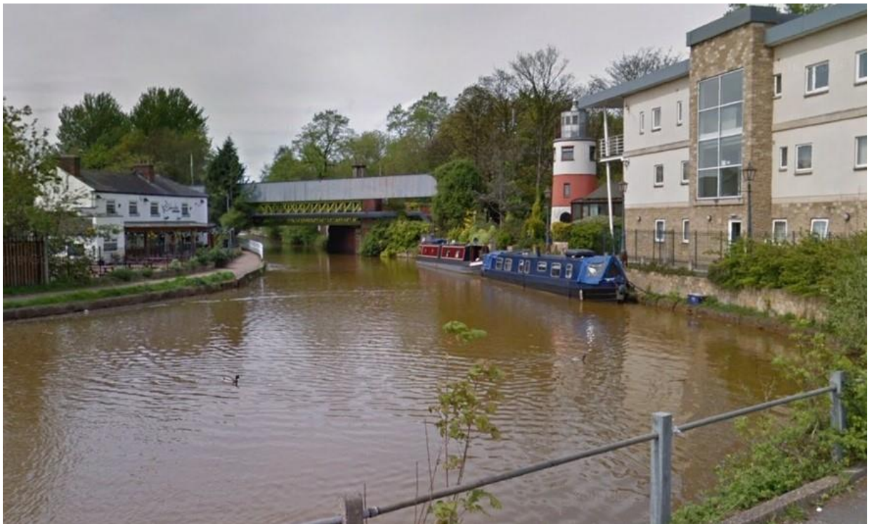
Monton Bridge 2020

The photograph, Monton Bridge circa 1885, shows the original bridge over the Bridgewater Canal, the lodge at Dukes Drive can be clearly seen behind the bridge. The building on the left was an off licence and is now the Waterside Restaurant.