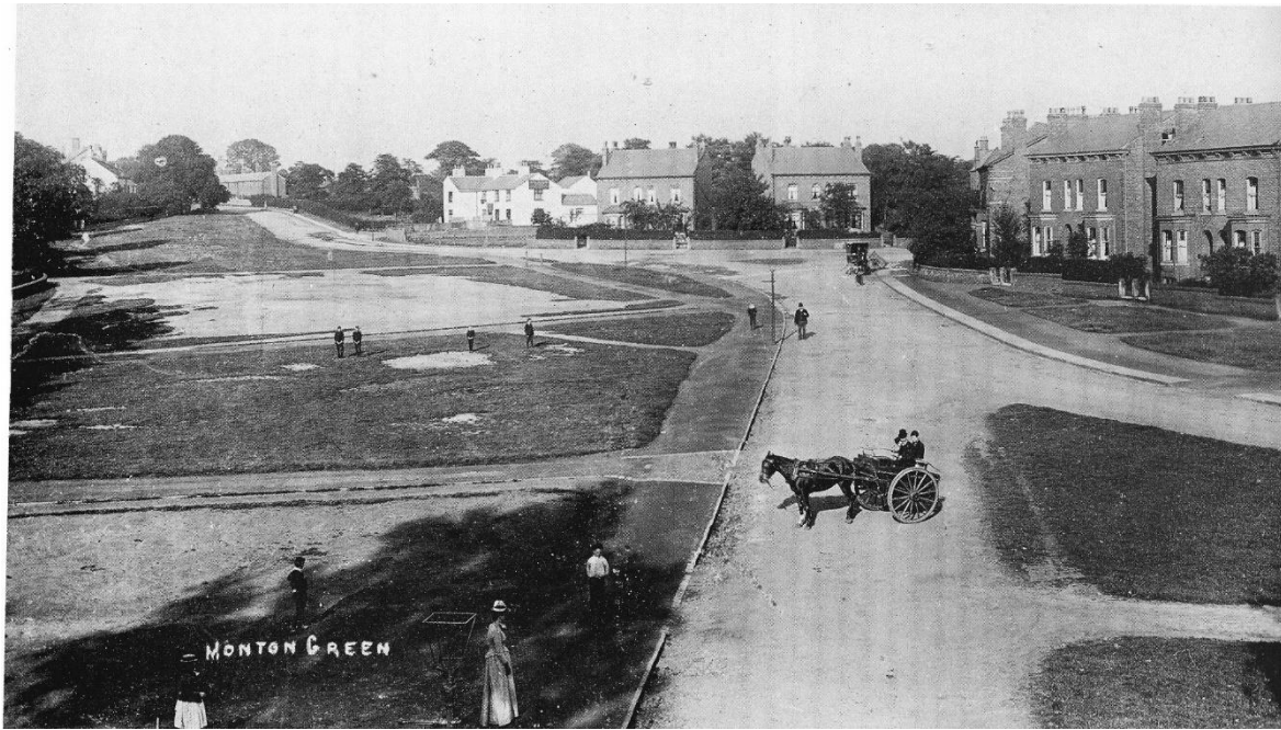
Monton Green c1885

The photograph, Monton Green c1885 shows a wonderful view looking across to the Blue Bell Inn; the original inn shown in this photograph was rebuilt in 1902. As drones were not that common in Victorian times, this photograph must have been taken from the railway station adjacent to the railway bridge. The houses on the right, one in particular, have changed very little in 140 years as the Google street view photograph shows.