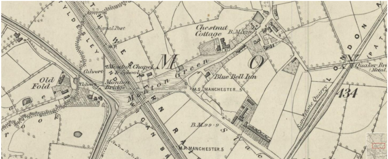
Map of Monton - 1848

The map of Monton Green 1848, which was surveyed in 1845, shows a sparsely developed Monton village with very few houses.