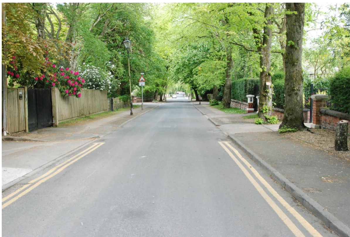
Sandwich Road 3 - 2020