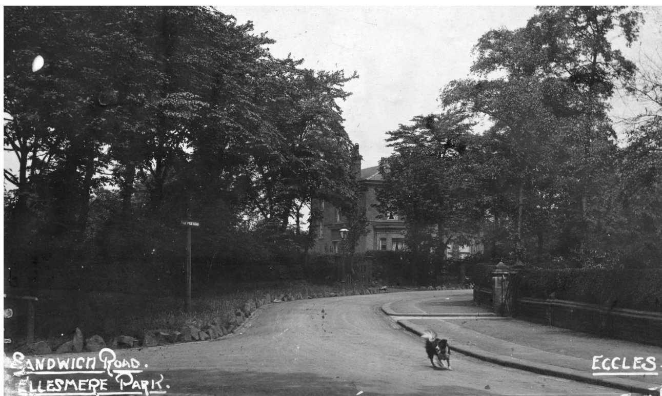
Sandwich Road 1 - c1895

The photograph Sandwich Road 1 – c1895 was taken at the junction of Victoria Road and Sandwich Road. The large house in the background is Sunny Bank which can be seen on both the 1893 and 1908 maps of the area. After Sunny Bank was demolished a development of four detached properties were built on the site, now called Sunnybank.