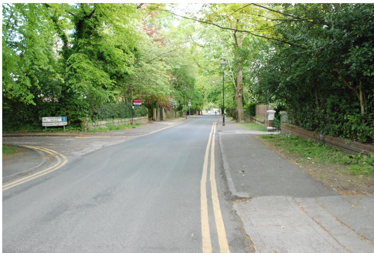
Sandwich Road 2 - 2020