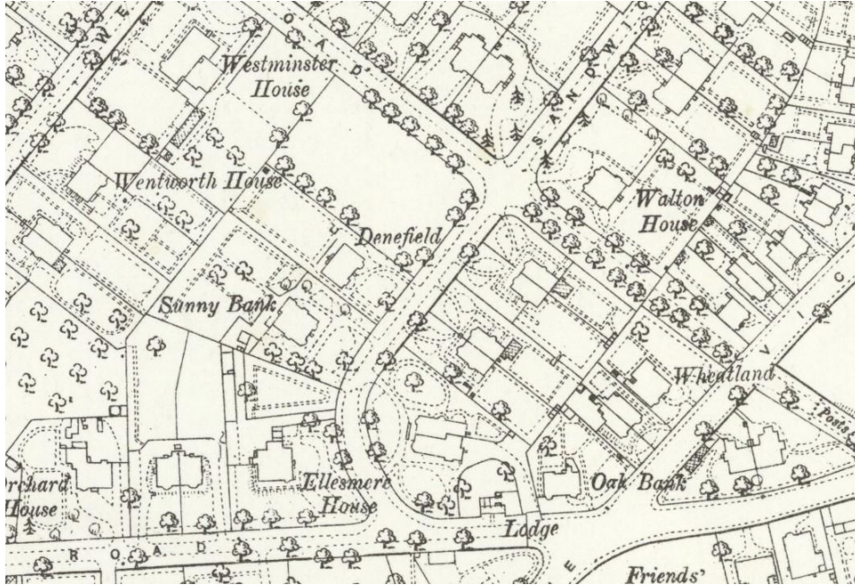
Map Sandwich Road - 1893

Three pictures of the south west end of Sandwich Road. I have included 2 maps of the area (1893 and 1905) so you can see the property developments over this period.