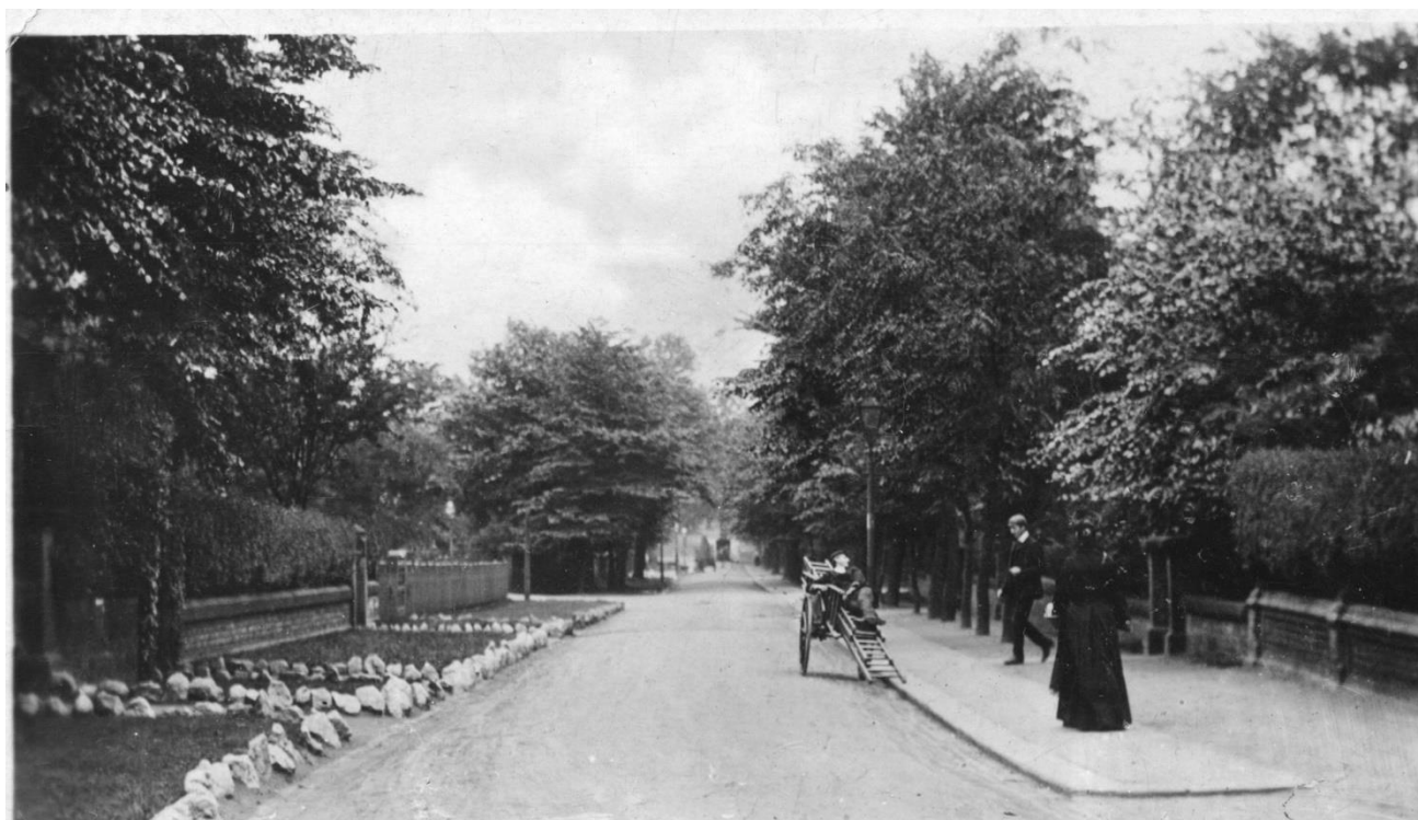
Sandwich Road 3 - c1912

Sandwich Road 3 – c1912, was taken a little further down Sandwich Road, the window cleaner looks like he is having a good rest.