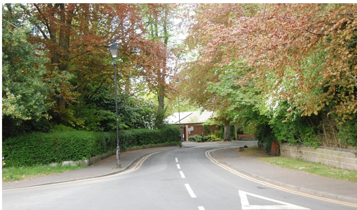
Sandwich Road 1 - 2020