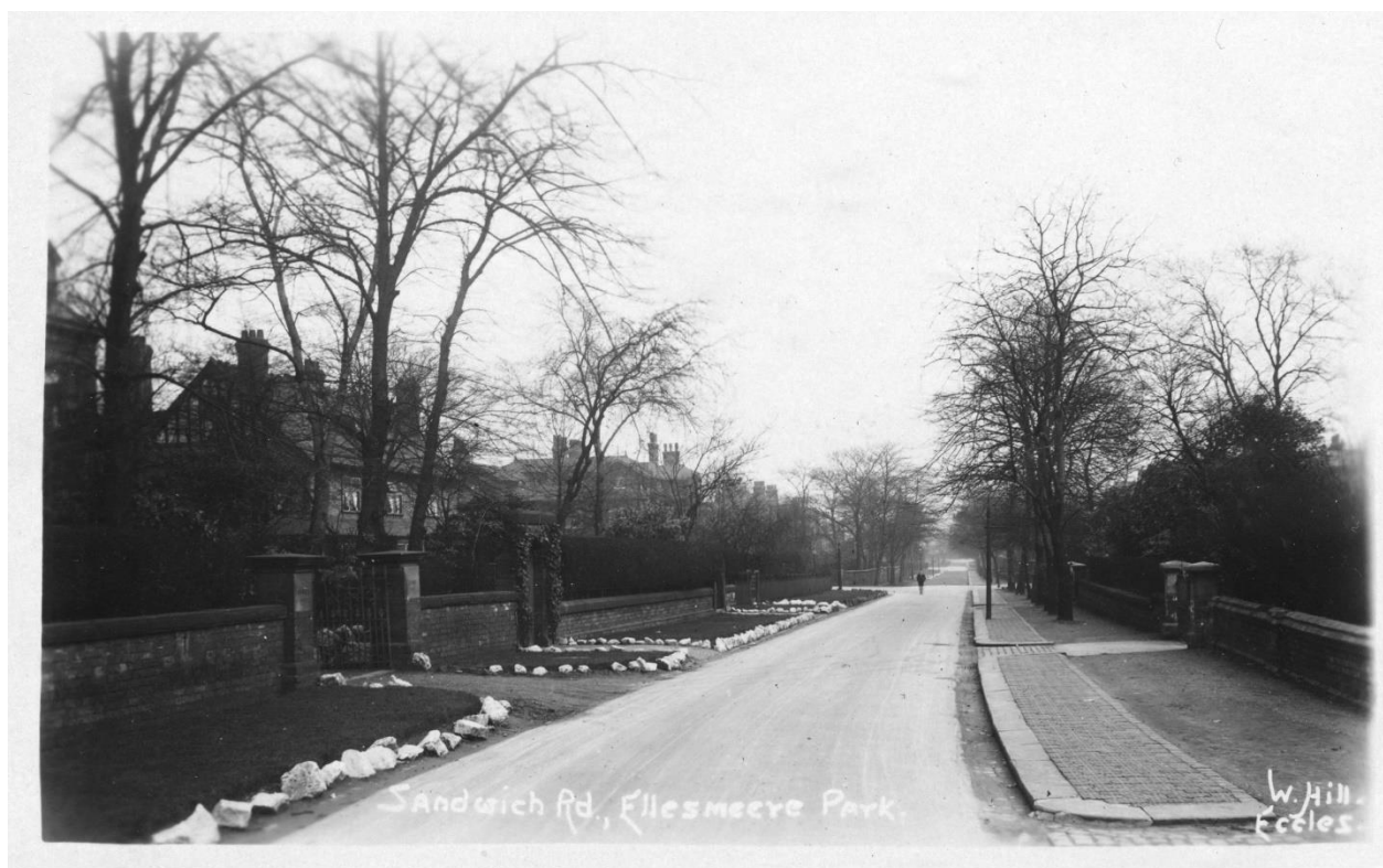
Sandwich Road 2 - c1912

Sandwich Road 2 – c1912 is looking towards the junction of Ellesmere Road. The house on the left, with the timbered gable, is one of the two pairs of Edwardian semidetached houses built on the corner of Sandwich Road and Ellesmere Road. These can be seen on the 1908 map.